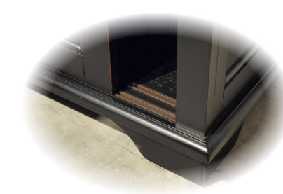
Simple but effective glide system allow the doors to open/close smoothly (A1-DT145B)