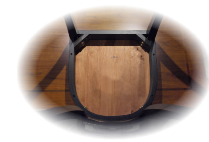
Chairs are corner-blocked on all four sides for rigidity and durability