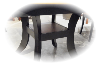
Table base features open design with storage shelf and leg levelers for uneven floor (T1-DT4057)