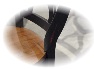
Hand-rubbed two-tone finish with the rub-through revealed