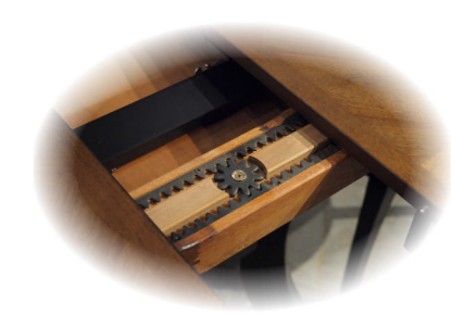
Geared table slides allow easy opening of the table, even from just one side (T1-DT4059)