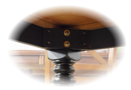
Each leg is securely fastened with 2 oversized bolts, ensuring extra stability and durability (T1-DT4278)