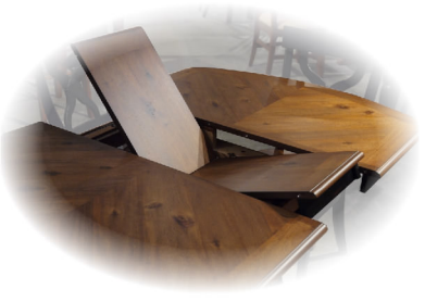
• Self-storing butterfly leaf extends the table when more space is required