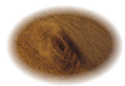
Accacia veneer with natural knots is accented with worm holes for the authentic rustic look